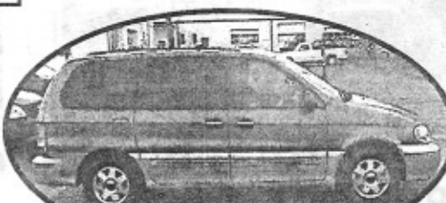
2003 Kia Sedona, loaded, dual sliding doors, Capt. Chairs, Low Miles