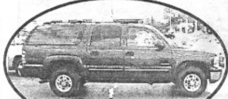
2000 Chevy Suburban, blue, 4x4, 3rd row seat, 3/4 ton, LOW MILES