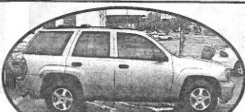
2003 Chevy Trailblazer, tan, LOADED, Great Payments