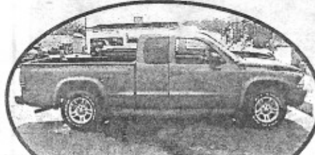
2004 Dakota Club Cab, low miles, auto, V6, LOW PAYMENTS