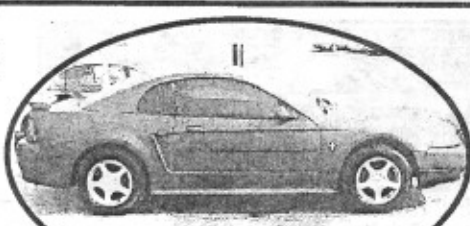
2003 Ford Mustang, auto, AC, loaded, LOW PAYMENTS