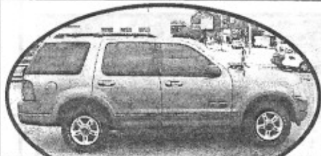
2002 Ford Explorer XLT, tan, 4x4, 3rd row seat, LOADED

TDOT is also working with several other resource and regulatory agencies to implement similar agreements by summer 2008.