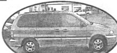
2003 Kia Sedona, loaded, dual sliding doors, Capt. Chairs, Low Miles