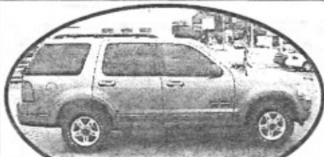
2002 Ford Explorer XLT, tan, 4x4, 3rd row seat, LOADED