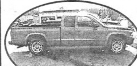
2004 Dakota Club Cab, low miles, auto, V6, LOW PAYMENTS