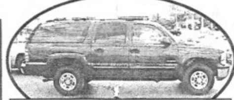
2000 Chevy Suburban, blue, 4x4, 3rd row seat, 3/4 ton, LOW MILES