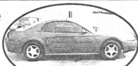
2003 Ford Mustang, auto, AC, loaded, LOW PAYMENTS