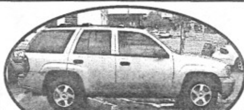
2003 Chevy Trailblazer, tan, LOADED, Great Payments