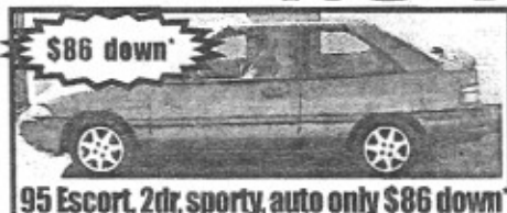
95 Escort, 2dr, sporty, auto only $86 down*