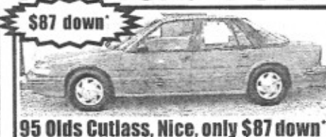
95 Olds Cutlass, Nice, only $87 down*