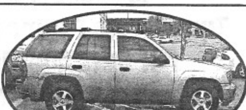
2003 Chevy Trailblazer, tan, LOADED, Great Payments