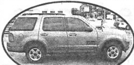
2002 Ford Explorer XLT, tan, 4x4, 3rd row seat, LOADED