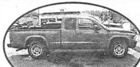
2004 Dakota Club Cab, low miles, auto, V6, LOW PAYMENTS