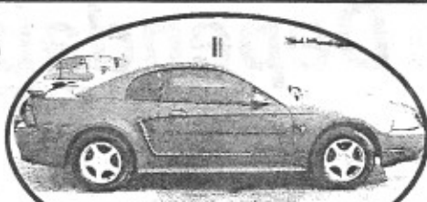
2003 Ford Mustang, auto, AC, loaded, LOW PAYMENTS