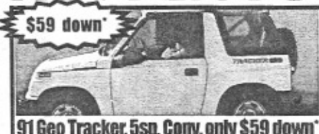
91 Geo Tracker, 5sp, Conv. only $59 down*