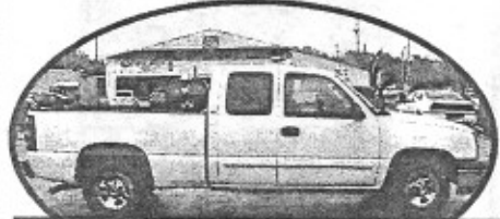
2003 Chevy Silverado, ex. cab, V8, auto, LOW MILES