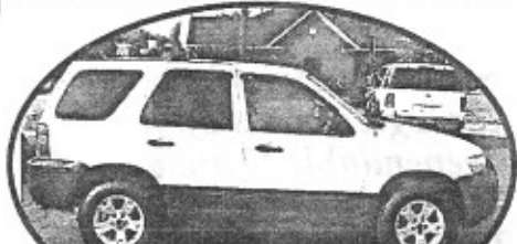
2003 Kia Sedona, loaded, dual sliding doors, Capt. Chairs, Low Miles