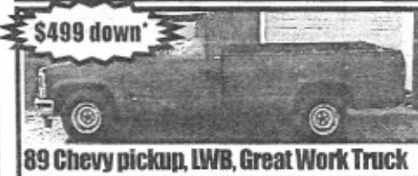
89 Chevy pickup, LWB, Great Work Truck