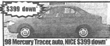
98 Mercury Tracer, auto, NICE $399 down*