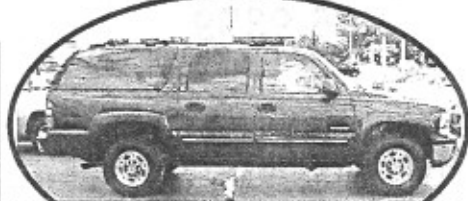
2000 Chevy Suburban, blue, 4x4, 3rd row seat, 3/4 ton, LOW MILES