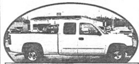
2003 Chevy Silverado, ex. cab, V8, auto, LOW MILES