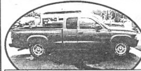
2004 Dakota Club Cab, low miles, auto, V6, LOW PAYMENTS