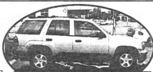
2003 Chevy Trailblazer, tan, LOADED, Great Payments