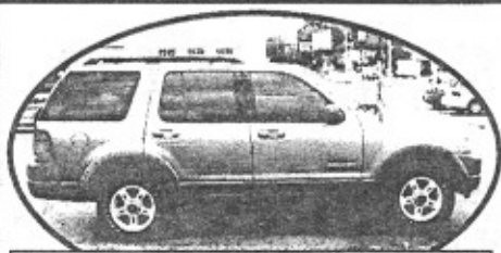
2002 Ford Explorer XLT, tan, 4x4, 3rd row seat, LOADED