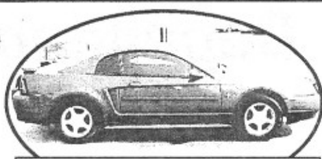
2003 Ford Mustang, auto, AC, loaded, LOW PAYMENTS