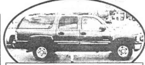
2000 Chevy Suburban, blue, 4x4, 3rd row seat, 3/4 ton, LOW MILES