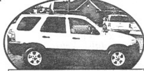
2003 Kia Sedona, loaded, dual sliding doors, Capt. Chairs, Low Miles