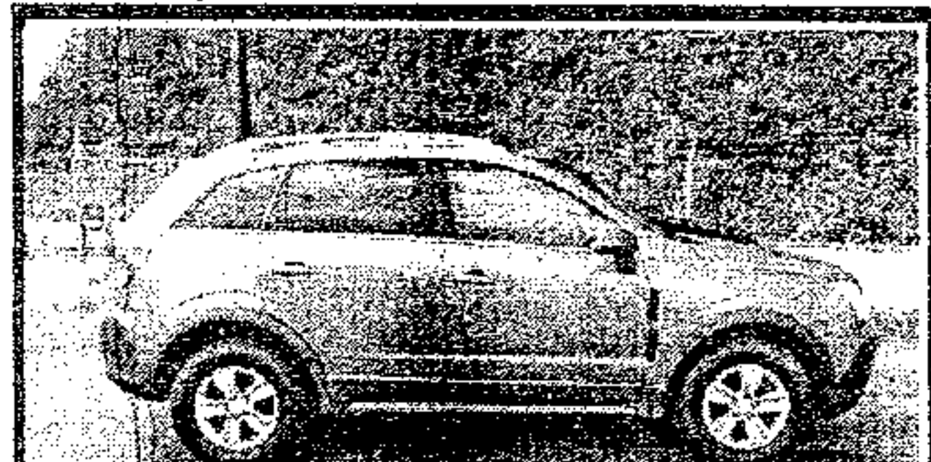
2008 Saturn VUE, 91k miles, Leather, Sunroof AWD Nice