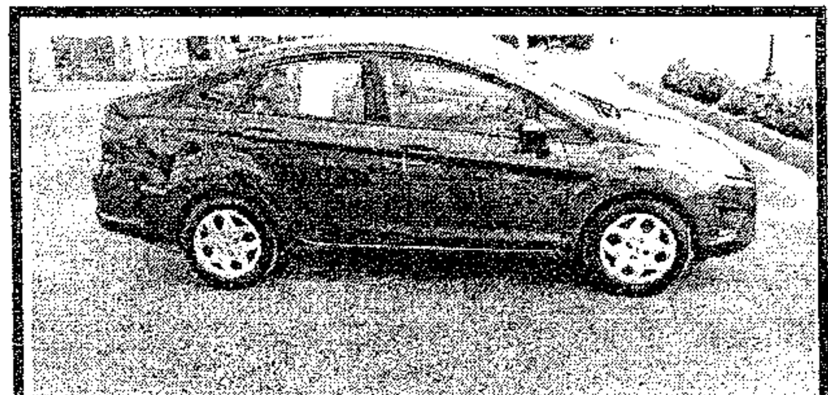
2012 Fiesta, Manual, alloy wheels, AC, Like New, 42k miles