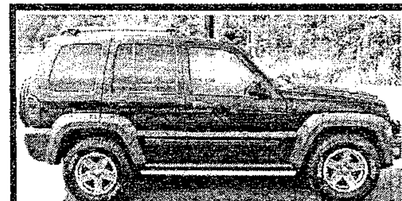
2005 Jeep Liberty, 114k miles, 4x4, Trail Ready, Nice