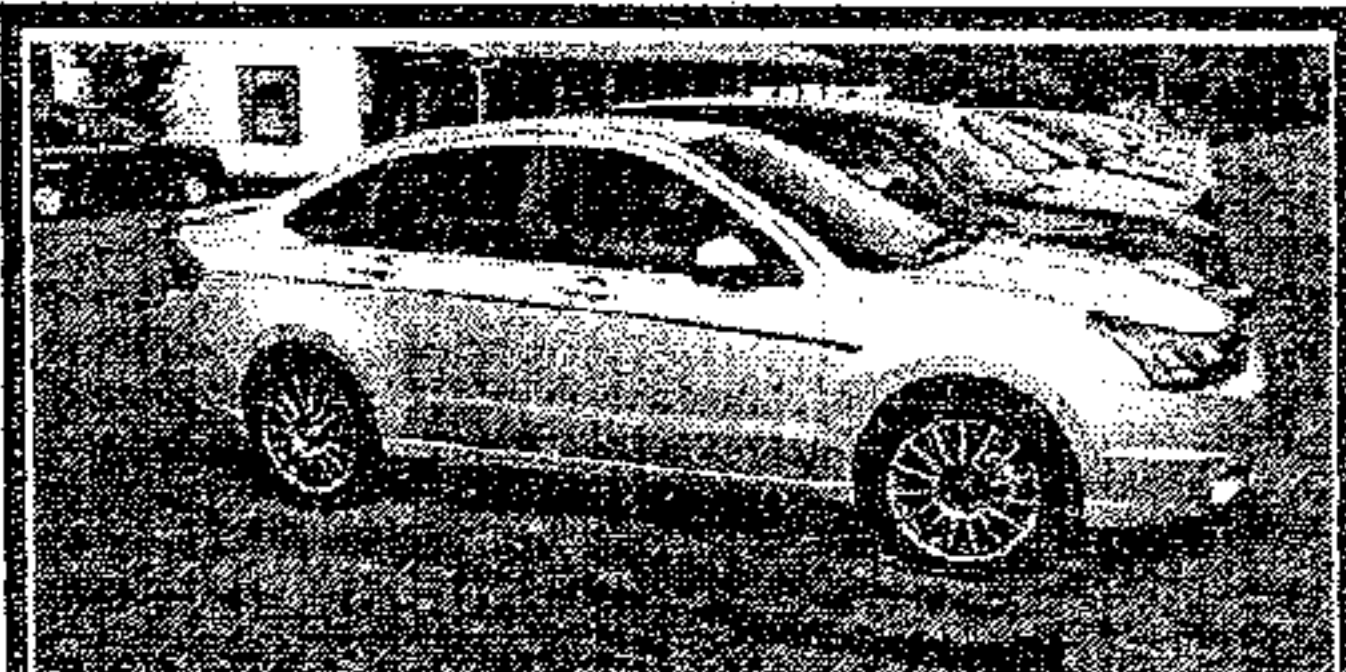
2010 Ford Focus, Sunroof, PW, PL, 88k miles