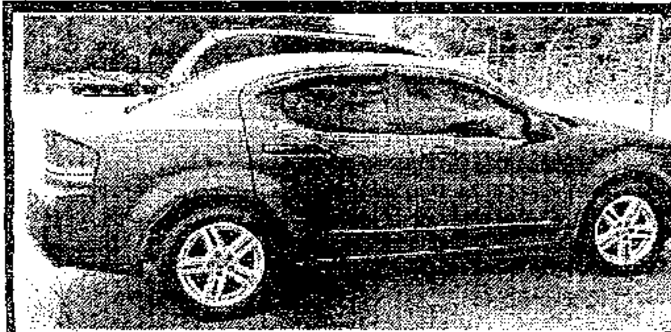
2008 Dodge Avenger, 114k miles, PW, PL, Extra Clean