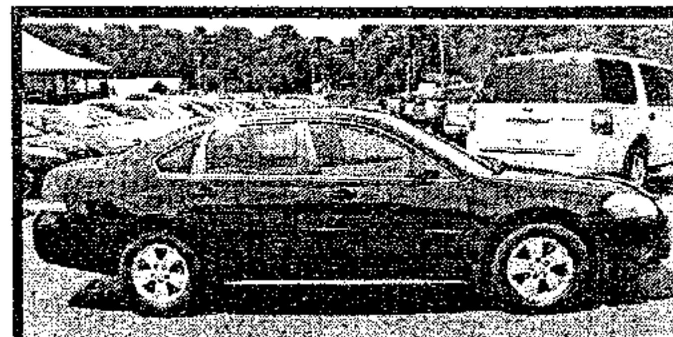
2011 Chevy Impala, 65k miles, Nice and Clean, Great Car