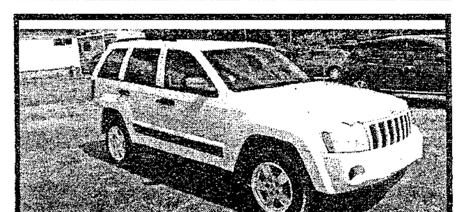
2006 Jeep Cherokee, 4WD, tow pkg, auto, AC, luggage rack