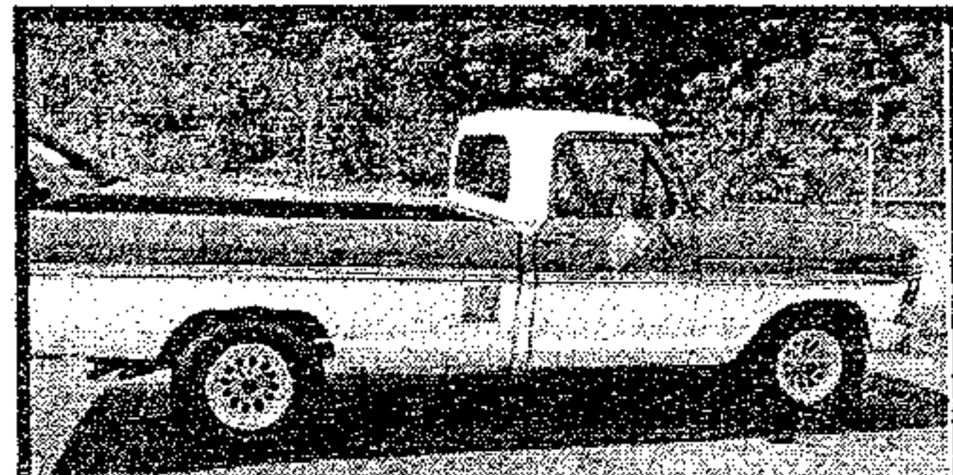
1972 Ford F250, Extra Clean, Nice Truck $4500 CASH

Over 100 Cars, Trucks & Vans in Stock - Warranties On ALL Vehicles Sold!!!