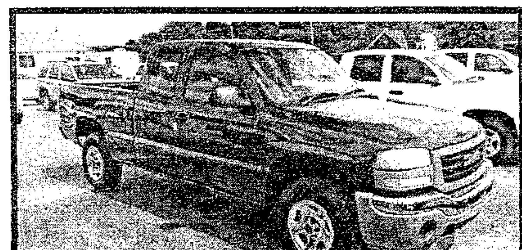
2004 Silverado, 4WD, 99k miles, auto, alloy wheels, tow pkg