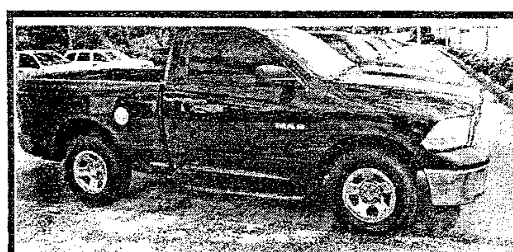
2009 Dodge Ram, auto, tow pkg, bedliner, AC, like new