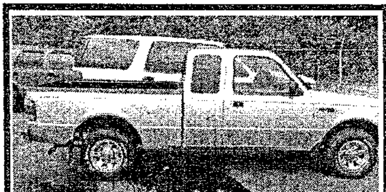
2002 Ford Ranger, Extra Cab, NICE, 75k miles