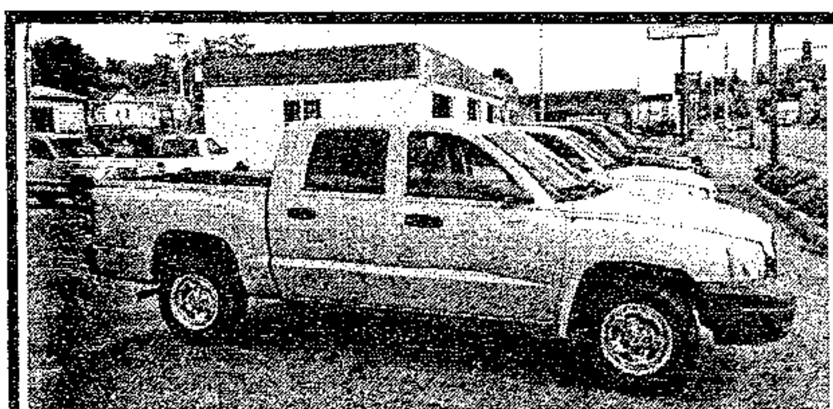
2005 Dakota, 4WD, Alloy Wheels, Tow pkg, Auto, V6