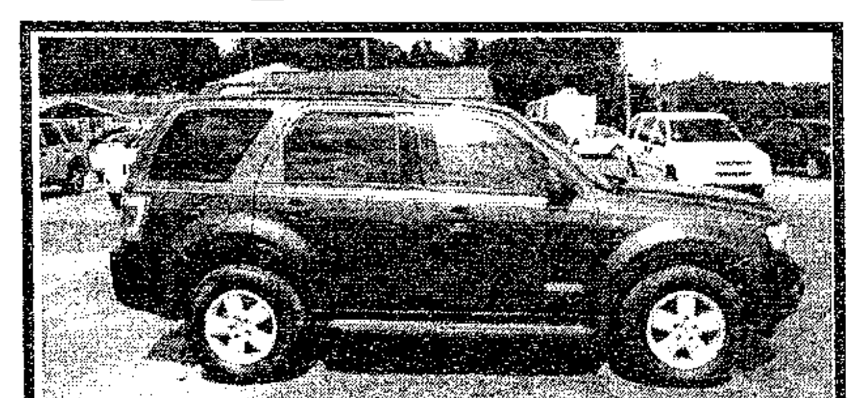
2008 Ford Escape, 4WD, V6, AC, Sunroof, 77k miles