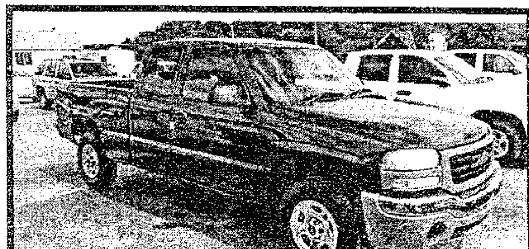
2004 Silverado, 4WD, 99k miles, auto, alloy wheels, tow pkg