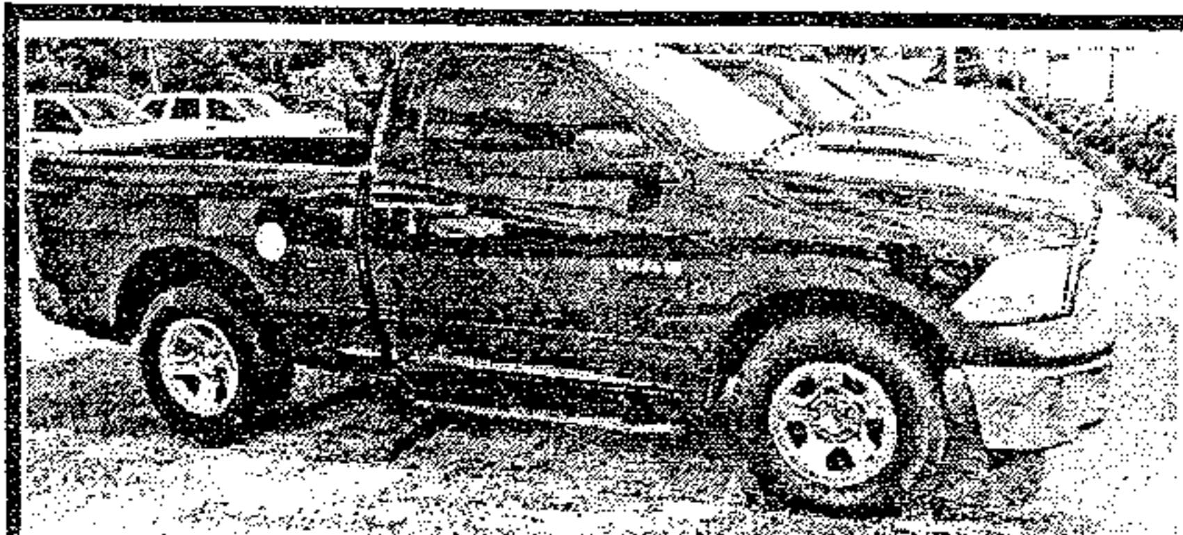
2009 Dodge Ram, auto, tow pkg, bedliner, AC, like new