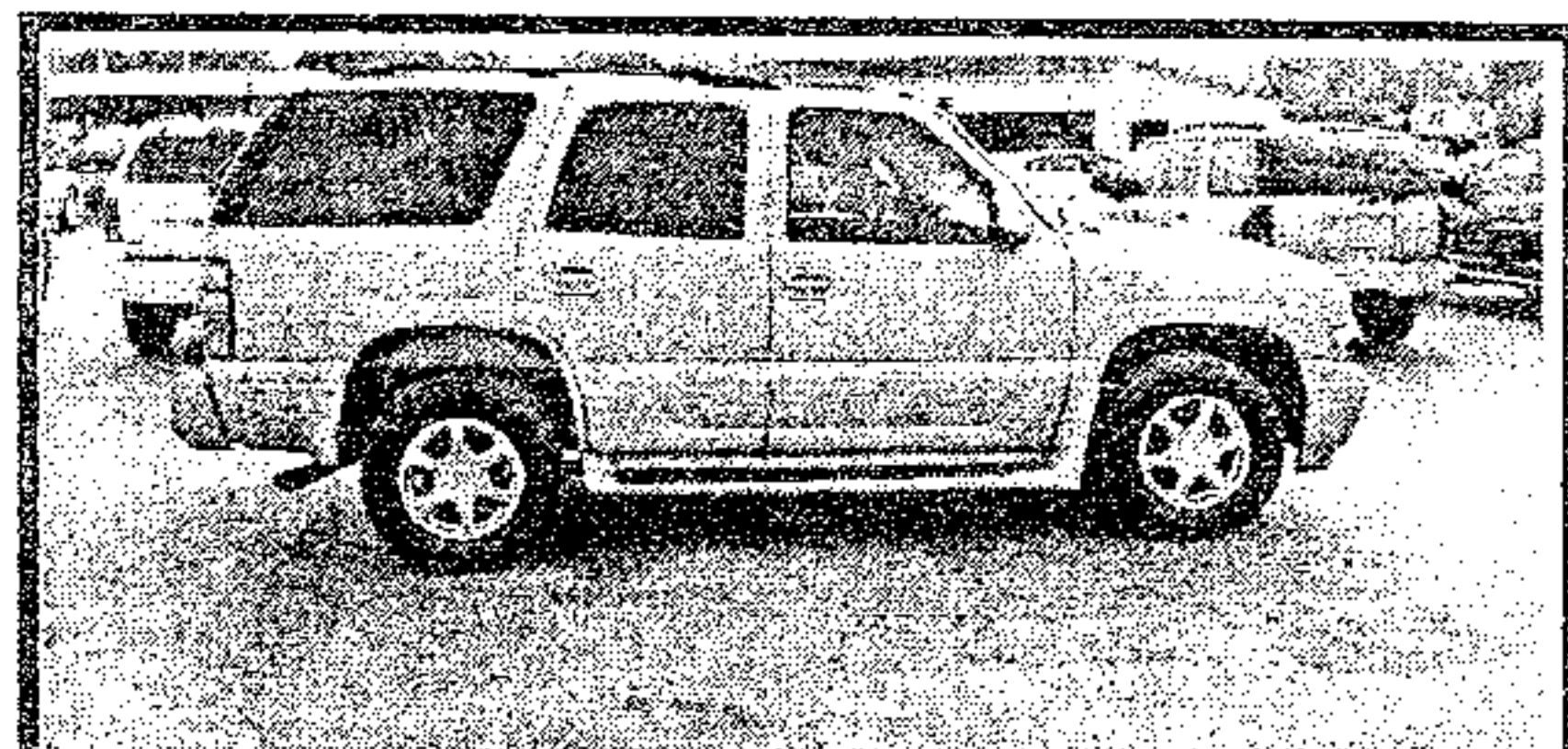
2005 GMC Yukon Denali, PW, PL, PS, 3rd Row, tow pkg, LOADED!!!