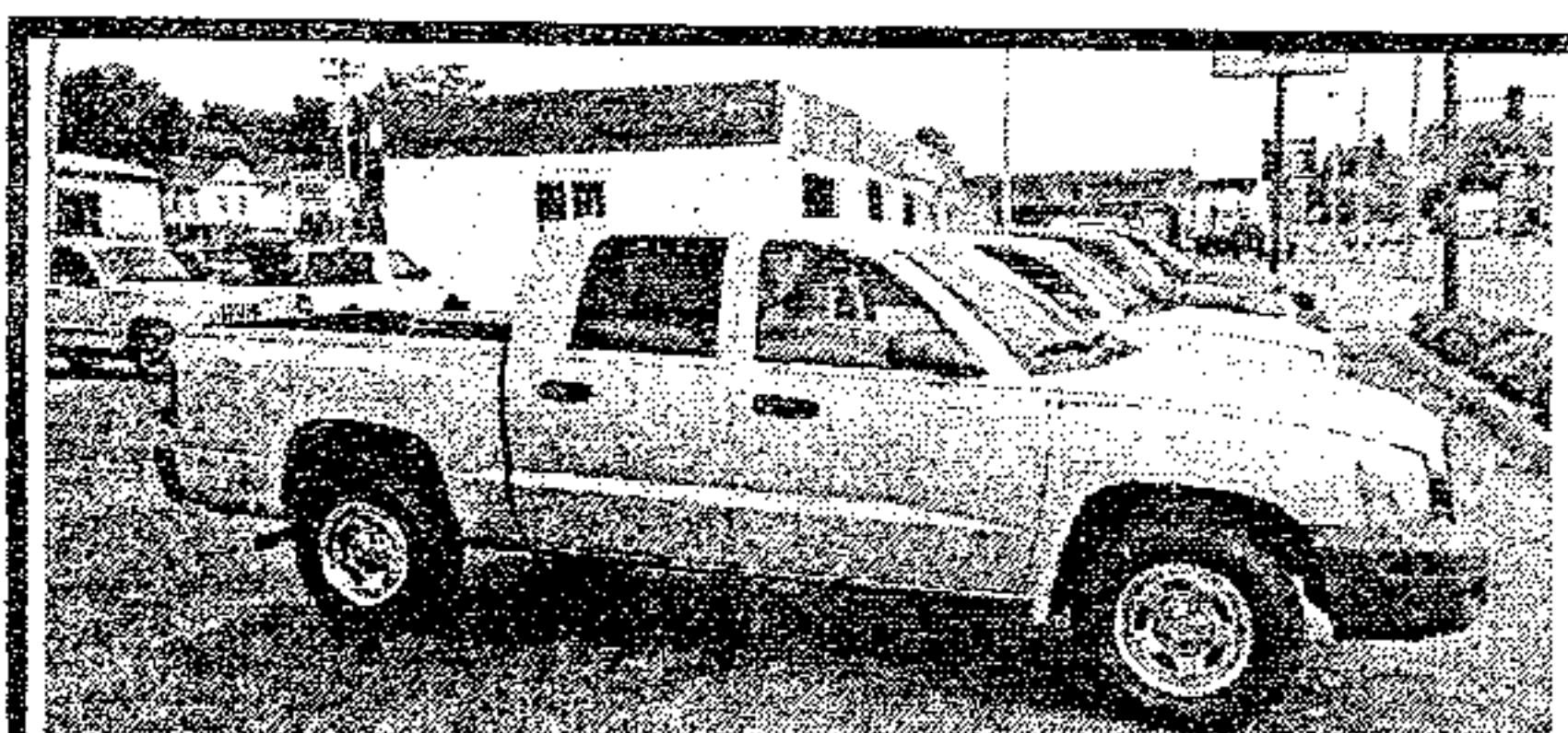
2005 Dakota, 4WD, Alloy Wheels, Tow pkg, Auto, V6