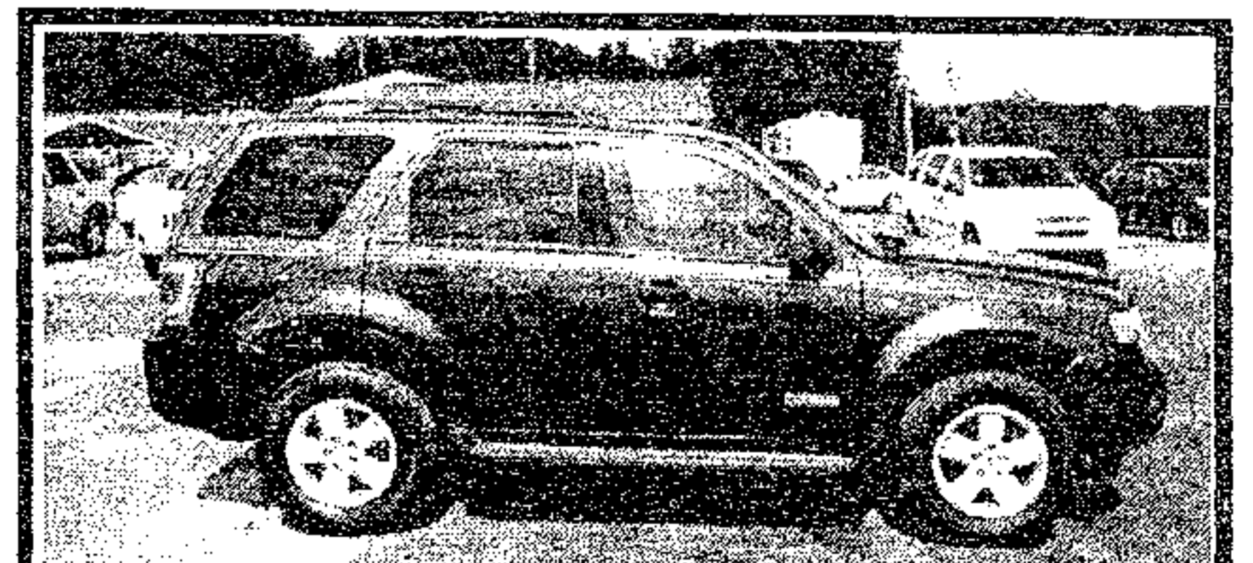
2008 Ford Escape, 4WD, V6, AC, Sunroof, 77k miles