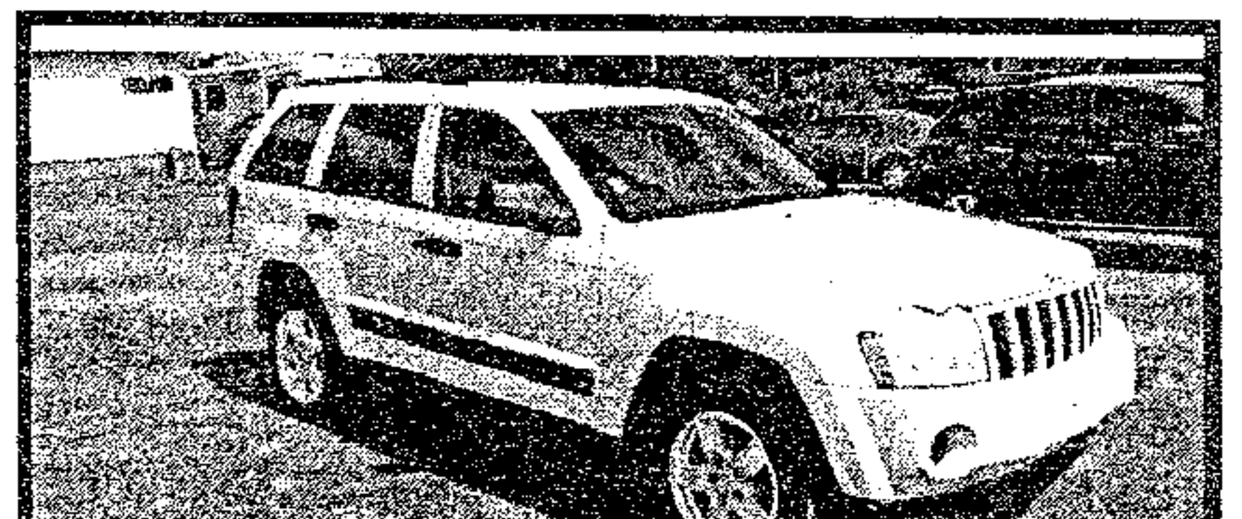
2006 Jeep Cherokee, 4WD, tow pkg, auto, AC, luggage rack

DEPENDABLE MOTORS 986-9343 803 E. Broadway • Lenoir City