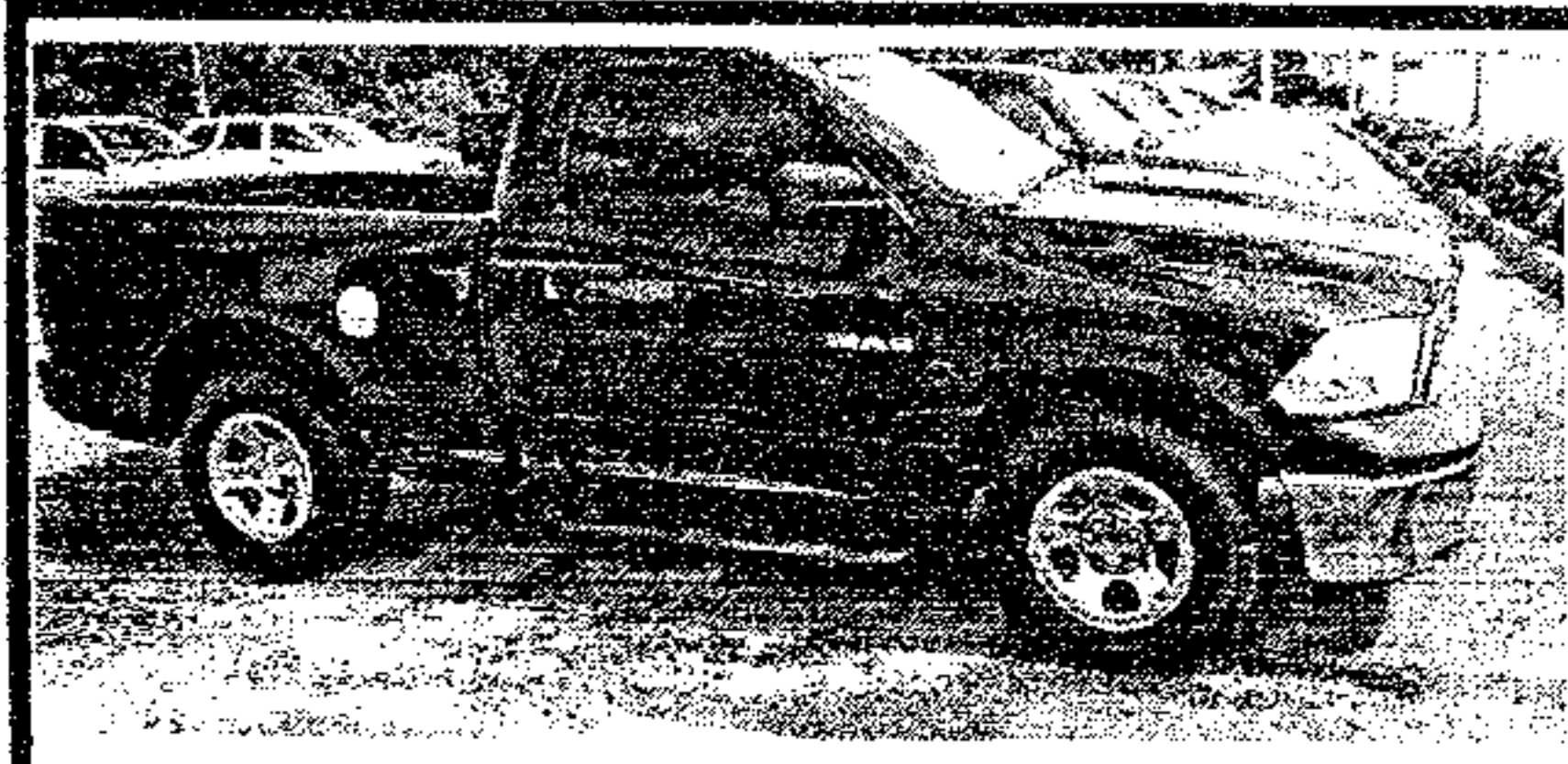
2009 Dodge Ram, auto, tow pkg, bedliner, AC, like new