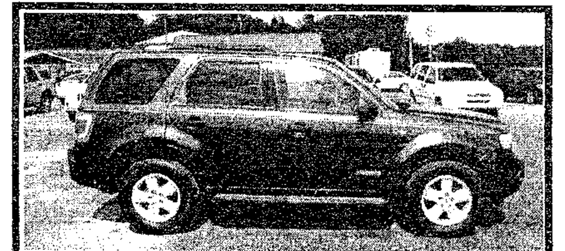
2008 Ford Escape, 4WD, V6, AC, Sunroof, 77k miles