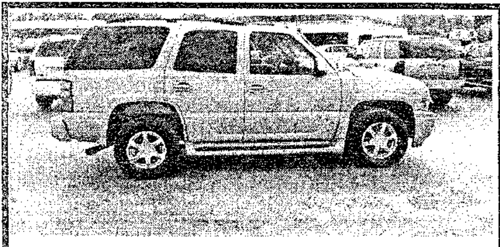
2005 GMC Yukon Denali, PW, PL, PS, 3rd Row, tow pkg, LOADED!!!