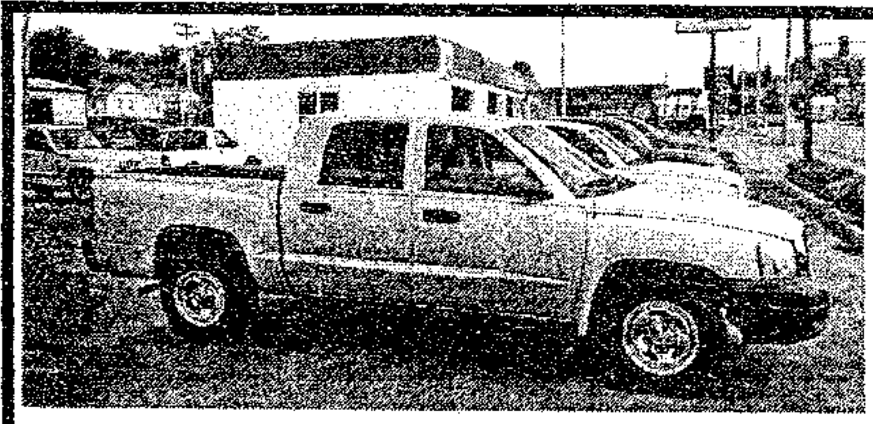
2005 Dakota, 4WD, Alloy Wheels, Tow pkg, Auto, V6