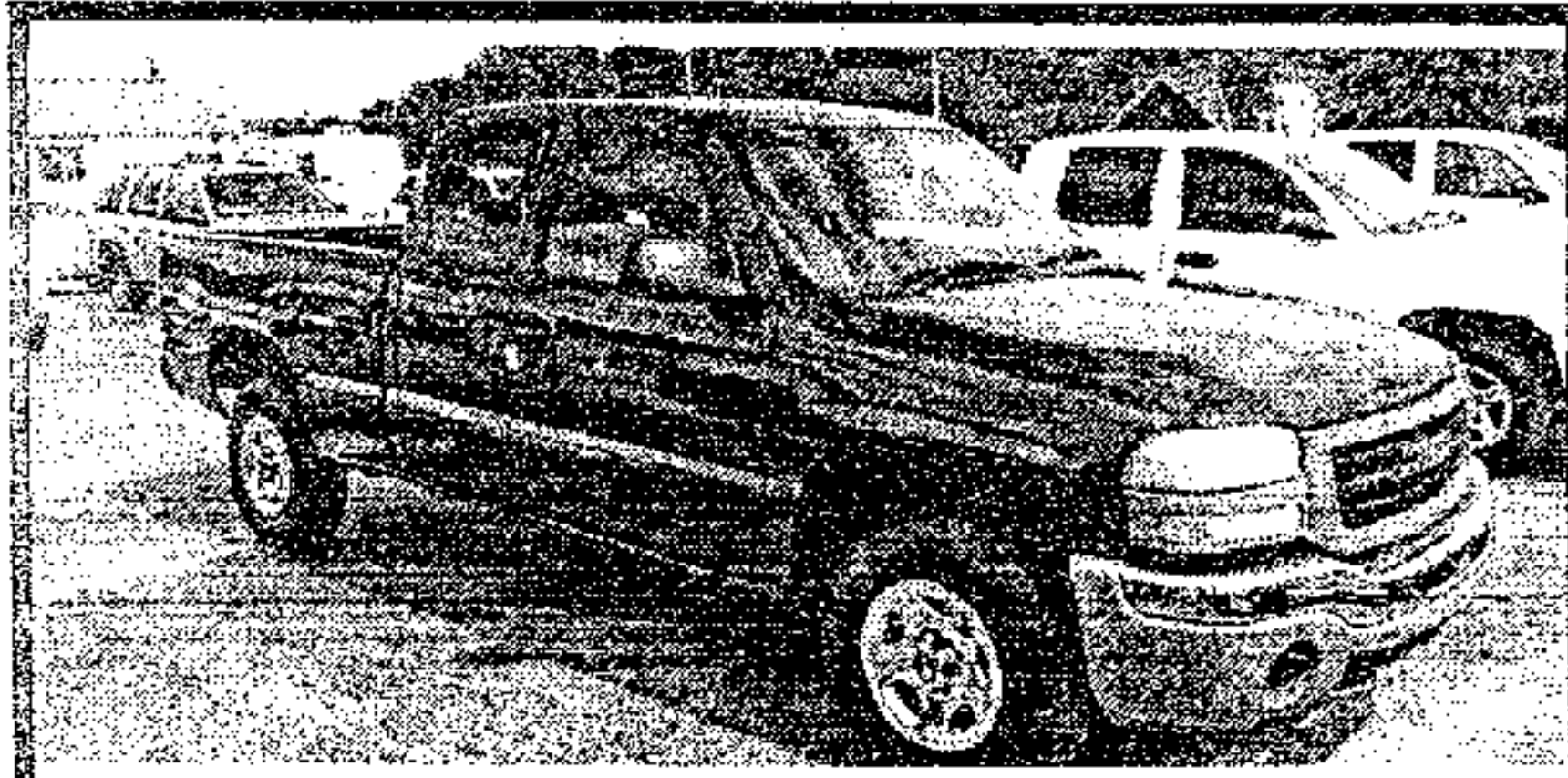
2004 Silverado, 4WD, 99k miles, auto, alloy wheels, tow pkg