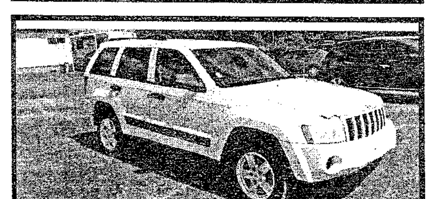
2006 Jeep Cherokee, 4WD, tow pkg, auto, AC, luggage rack