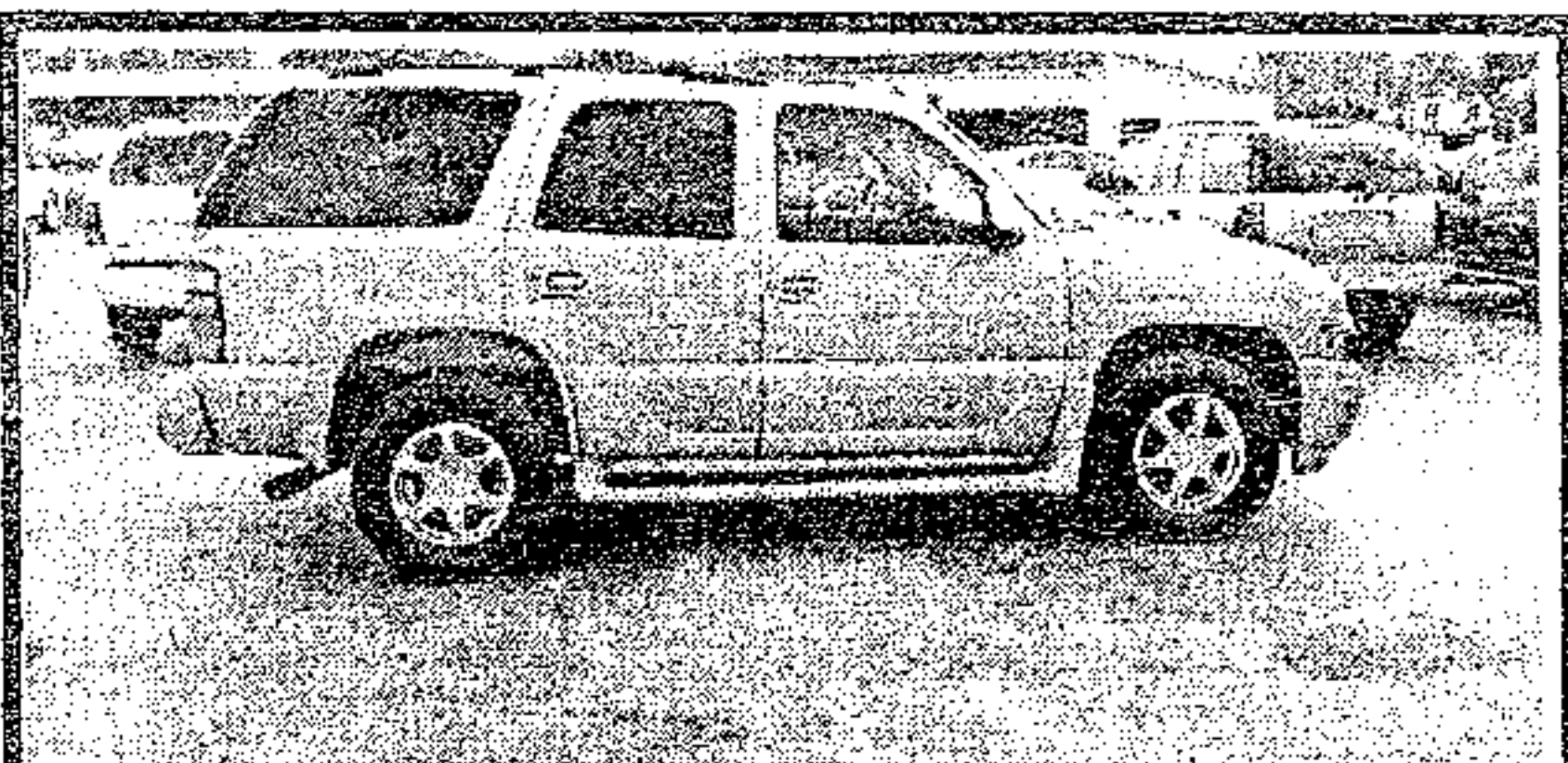
2005 GMC Yukon Denali, PW, PL, PS, 3rd Row, tow pkg, LOADED!!!