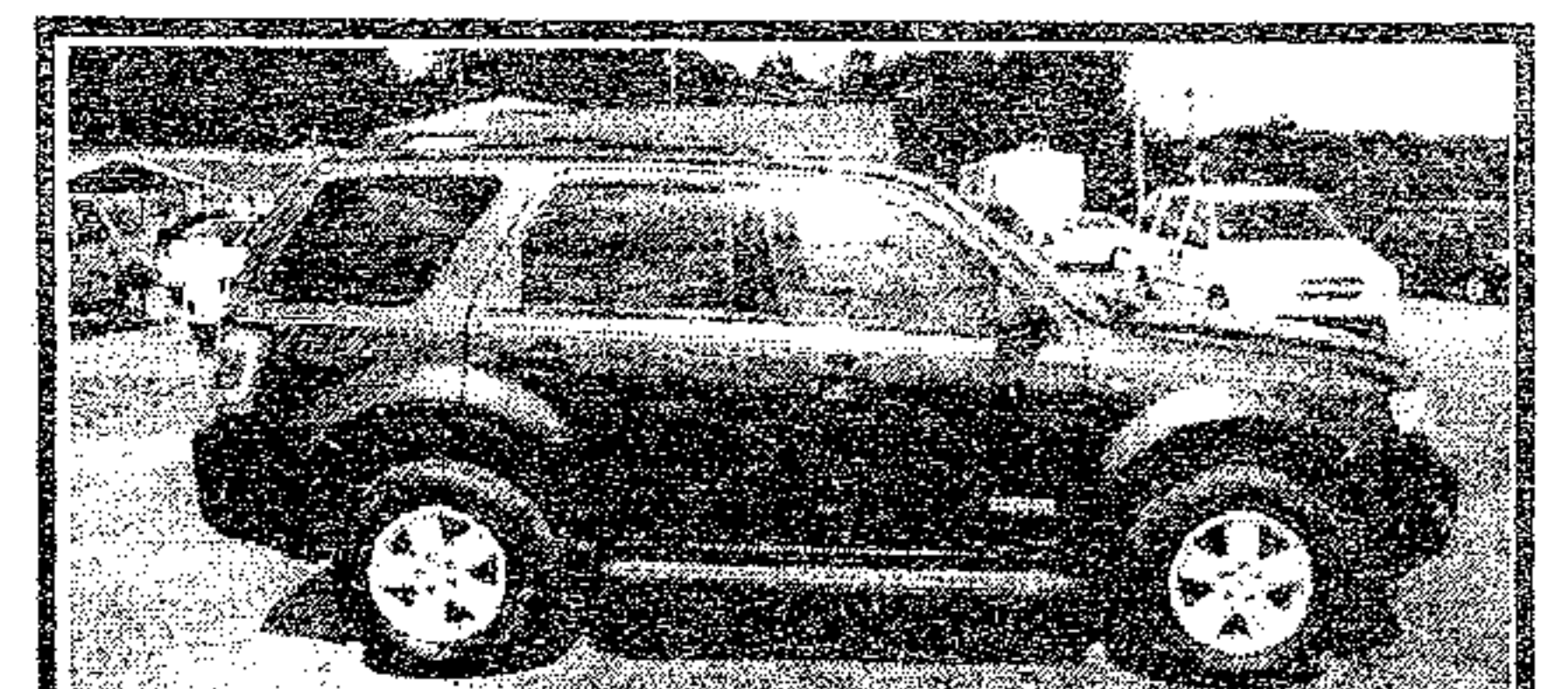
2008 Ford Escape, 4WD, V6, AC, Sunroof, 77k miles