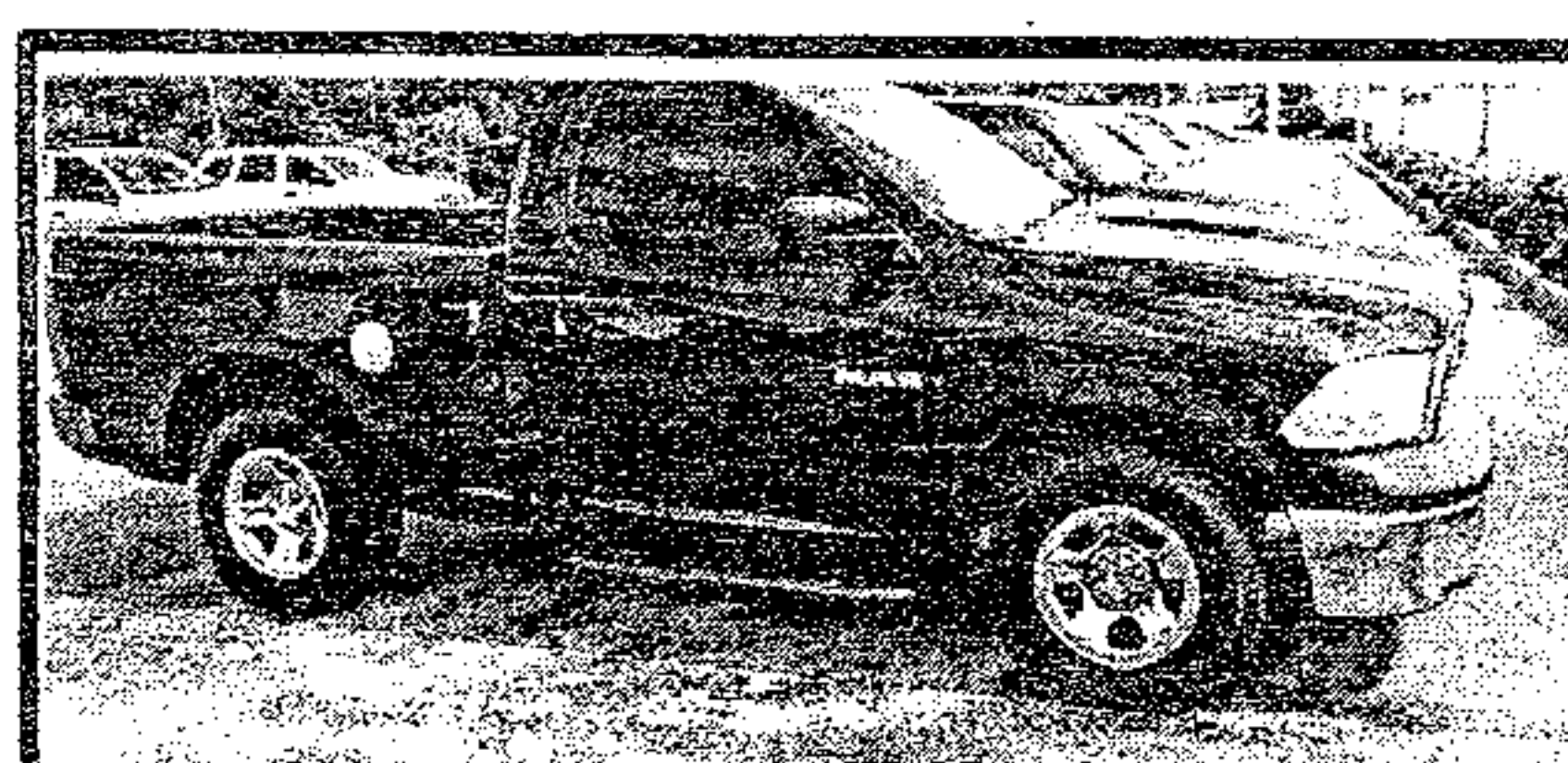
2009 Dodge Ram, auto, tow pkg, bedliner, AC, like new