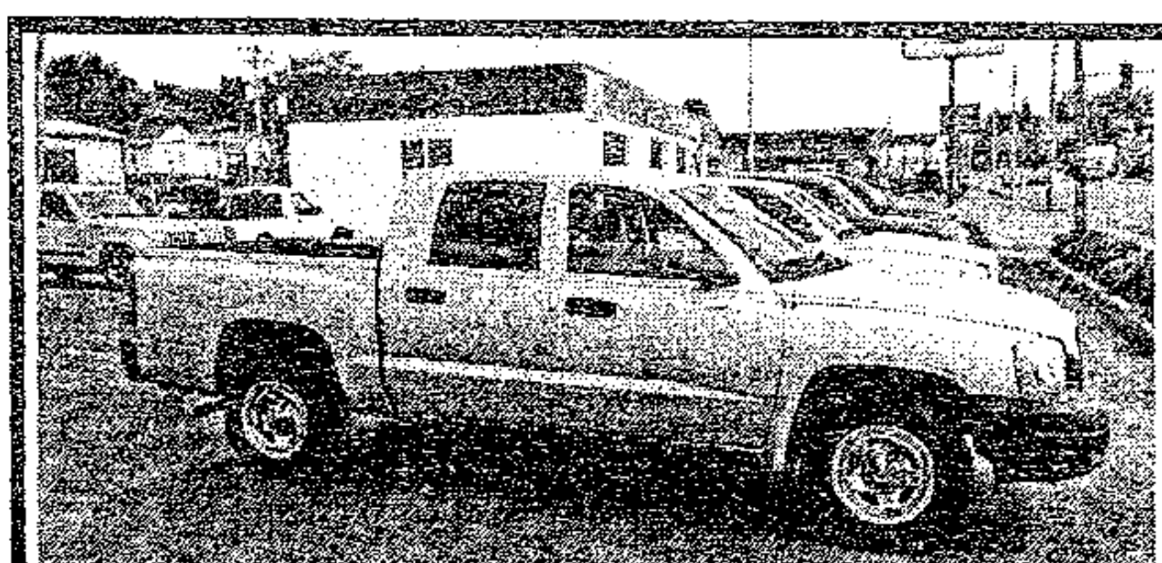
2005 Dakota, 4WD, Alloy Wheels, Tow pkg, Auto, V6