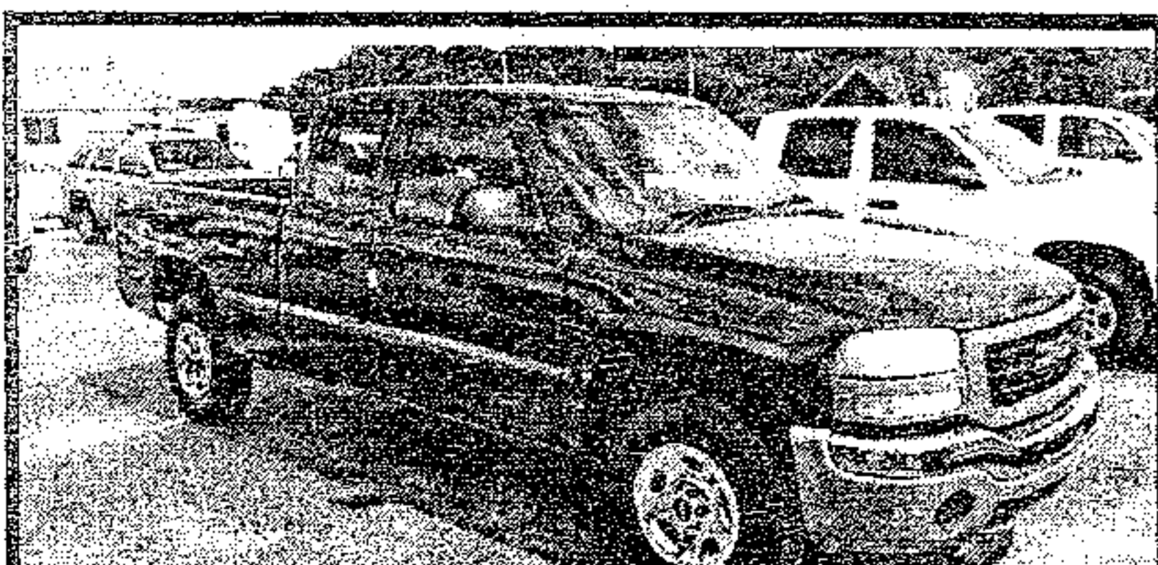
2004 Silverado, 4WD, 99k miles, auto, alloy wheels, tow pkg