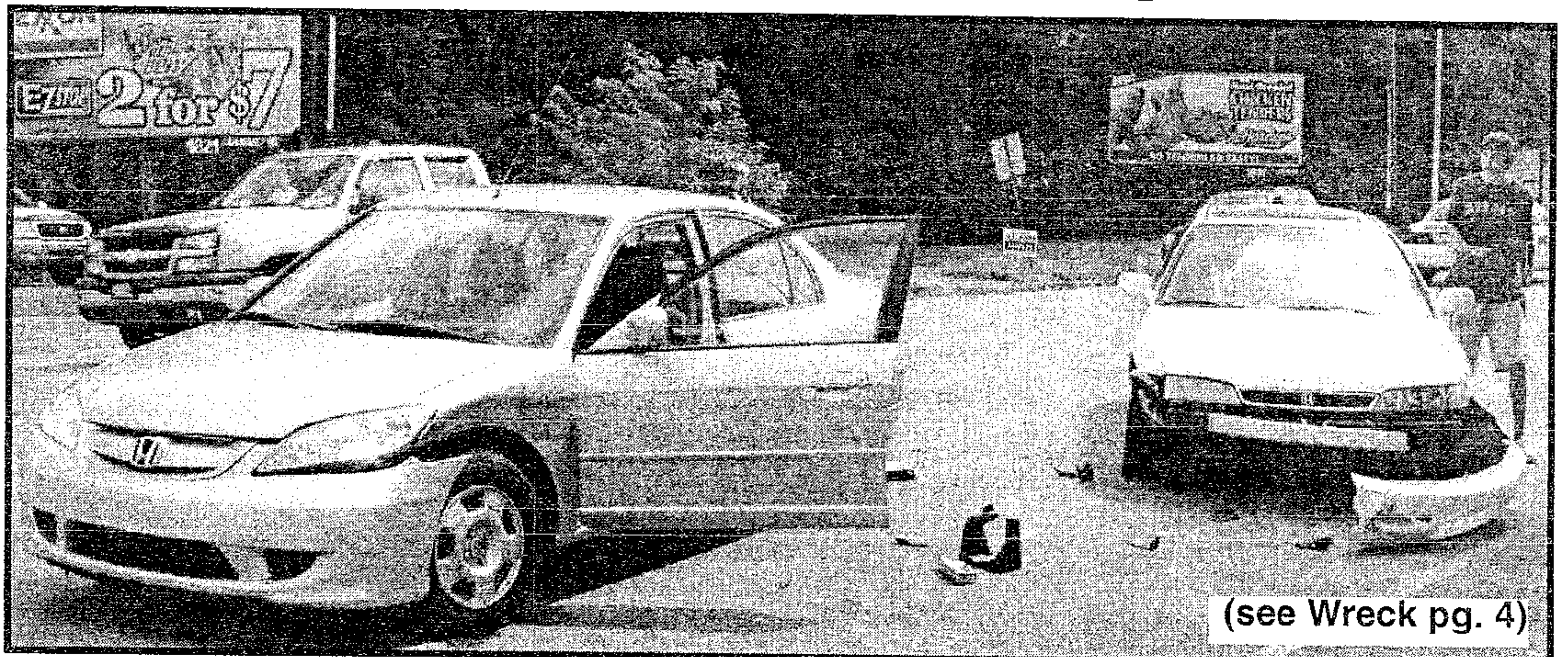
(see Wreck pg. 4)