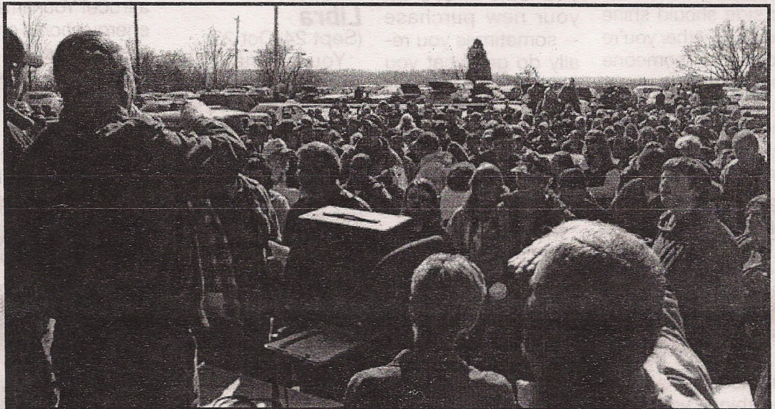
An estimated 500 people turned out to bid at the Sheriff's Auction held last Saturday at the Justice Center