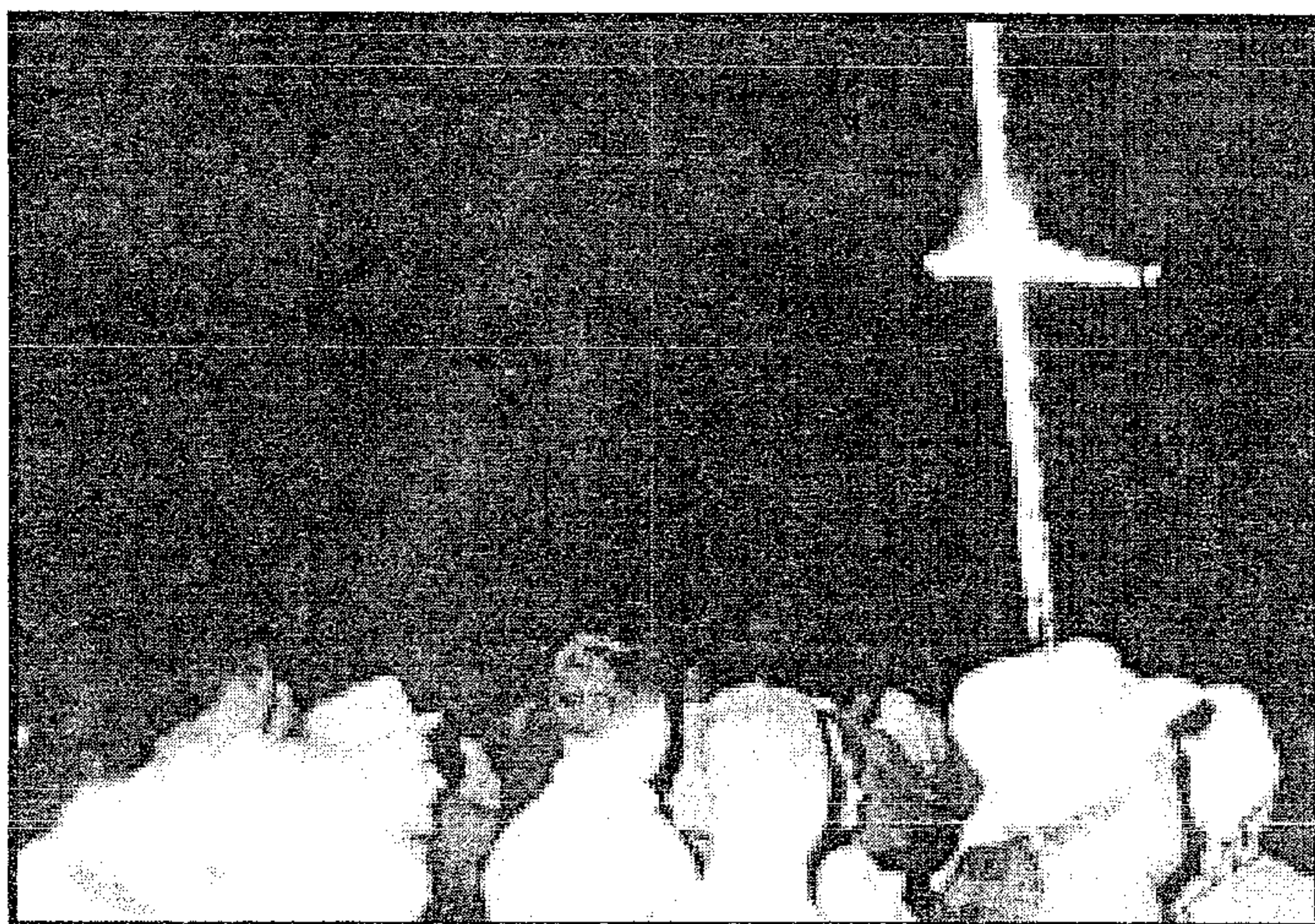
A group of people watching a cross burn.