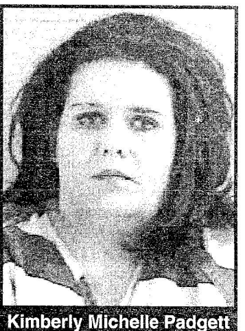
(see Padgett pg, 3)