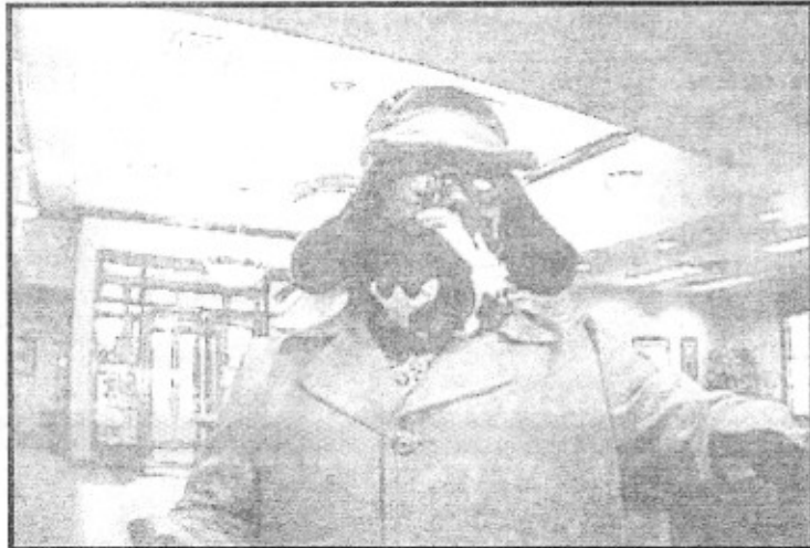
Officials are seeking the public's help in identifying this man suspected of robbing a Tennessee State Bank in Knoxville just after 12:30 PM Thursday