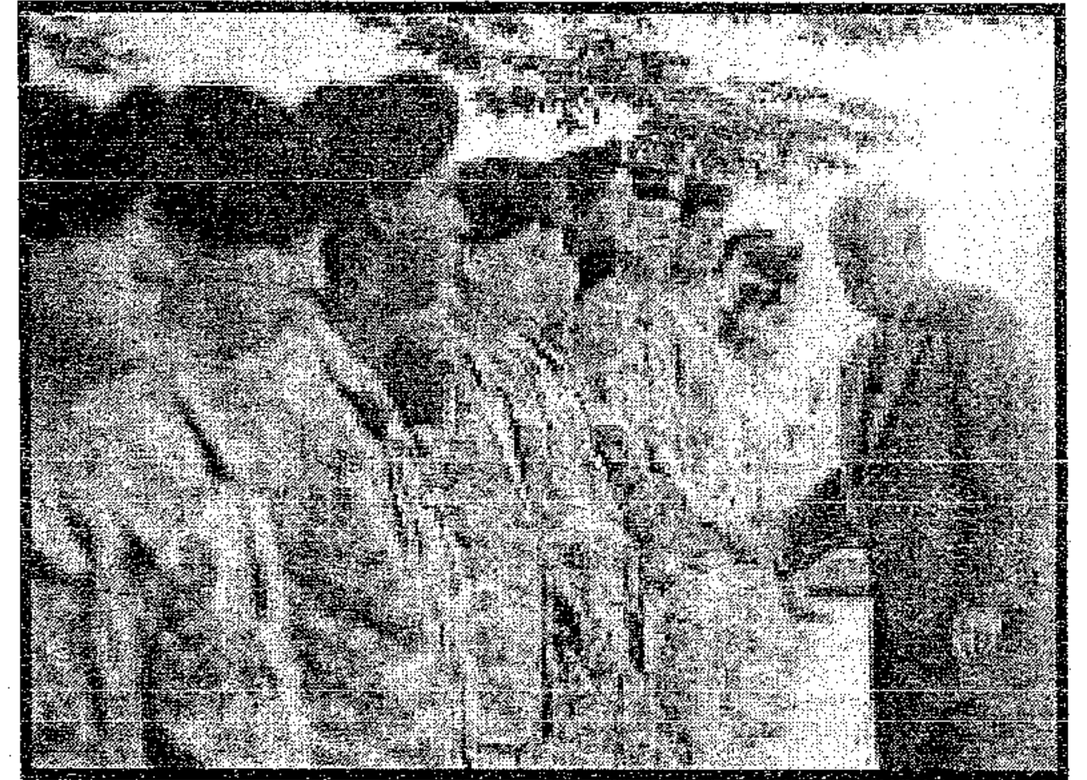
Bredesen Honors Veterans Working in State Government