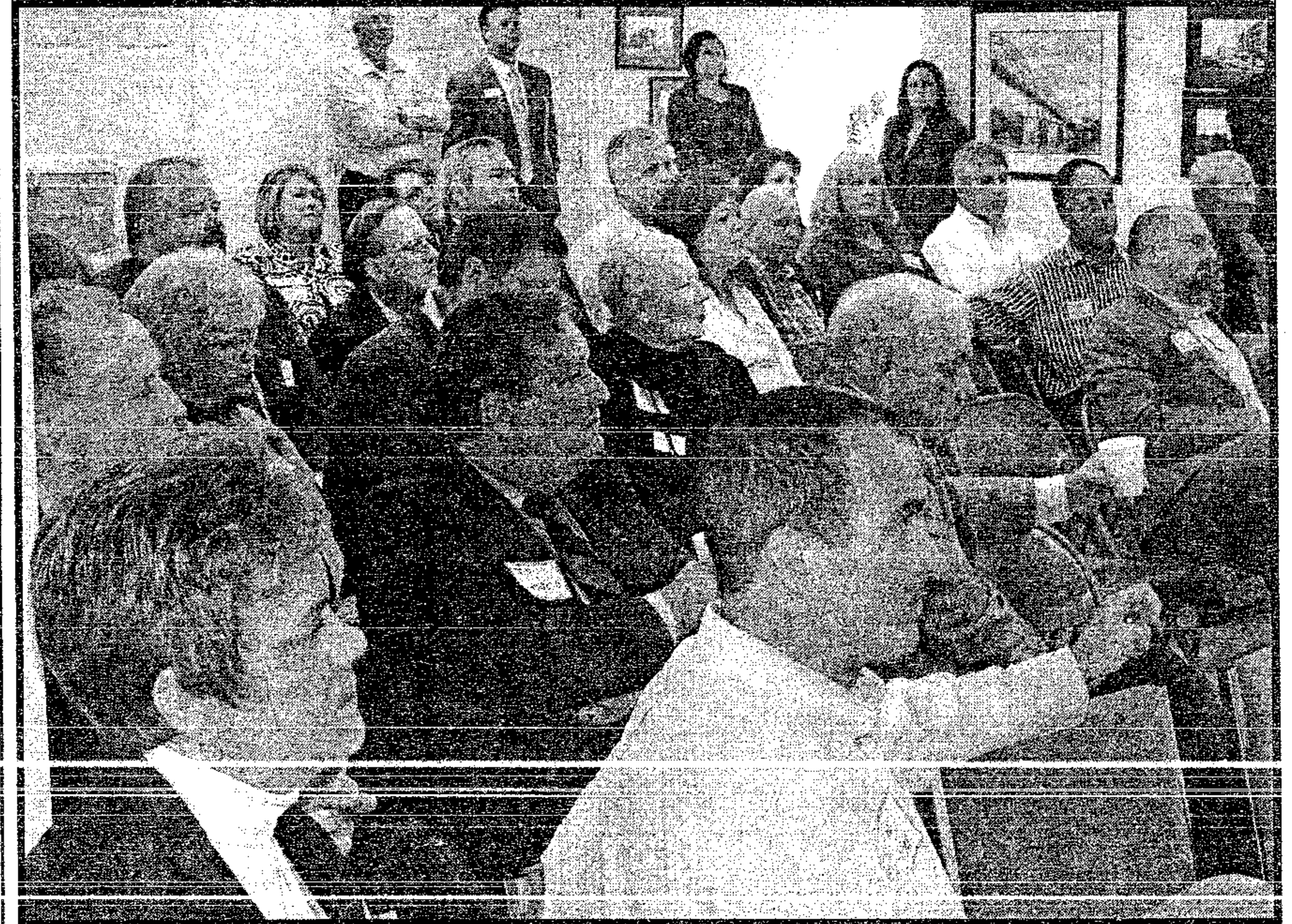
A group of citizens listen intently as Senator Corker addresses them at the Loudon County Visitors Center Tuesday morning.

Senator Bob Corker came to Loudon County to let citizens know what was going on in Washington and that he feels the number one issue is our country's indebtedness.