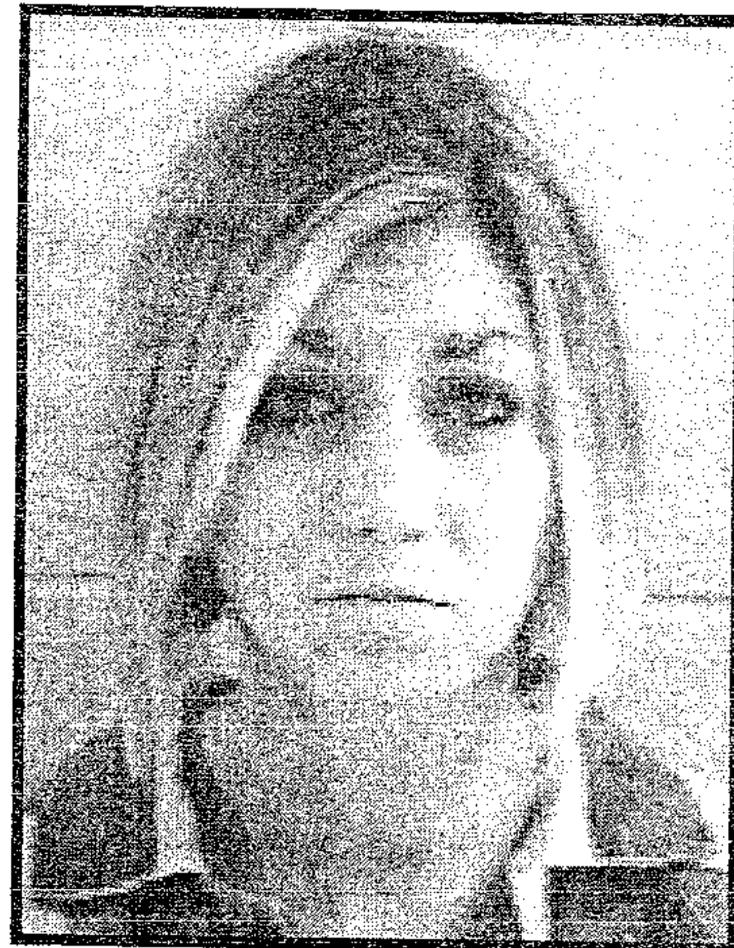
(see Fields pg. 5) Fields

According to affidavits filed by Detective Jonathan Sartin, LCPD; on or about September 29th, 2010, Ms. Fields was