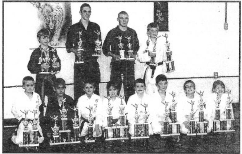
Photo right: Students at TTJC Karate in Loudon take home trophies for their achievements in several areas of martial arts competition at the Fall 2009 Smoky Mountain Pre Holiday Open Championship last November in Sevierville.