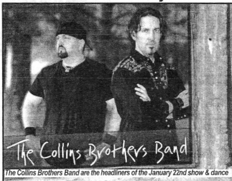
The Collins Brothers Band are the headliners of the January 22nd show & dance

They have had an abundance of experience in the music industry (see Jamboree pg. 3)